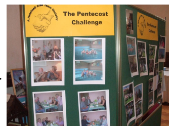
Pentecost Challenge Photos